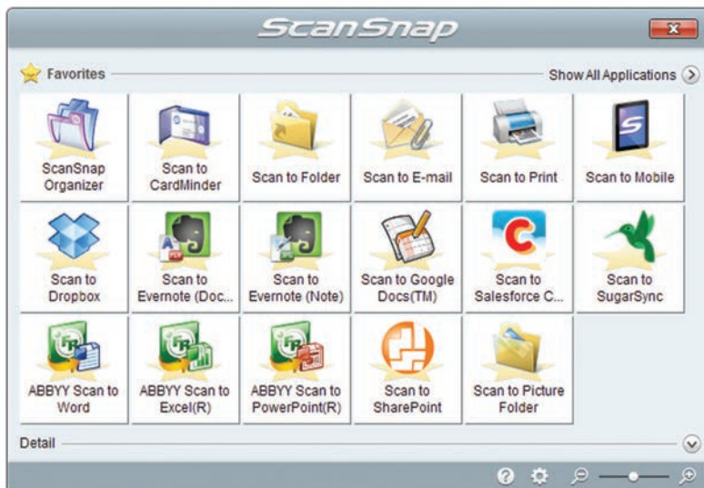
Quick Menu for Windows® shown

The ScanSnap Quick Menu for PC and Mac automatically pops up after scanning to provide you a variety of ways to be immediately productive with your scans. It can be easily customized to display just your favorites, present a recommendation, and even display custom profiles.