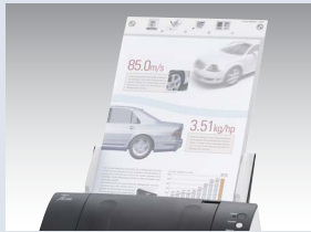
A3 Carrier Sheets

* Carrier Sheets (5 sheets per set) can be purchased separately. (The Carrier Sheet should be replaced approximately every 500 scans)