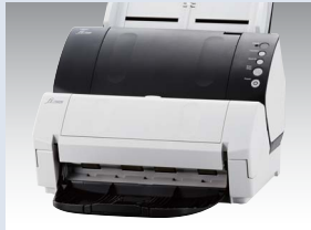
Post Imprinter (fi-718PR)

The optional imprinter unit prints identification markers like dates, alphanumeric codes and symbols on reverse side of the original document. This makes it easier to locate the originals of scanned document when you need to reference them.